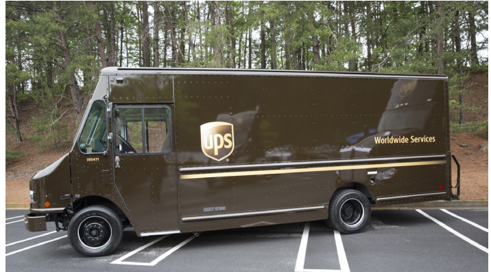
UPS aims to "lead the charge on electrification of medium-duty vehicles over the next five years," according to its 2017 Corporate Sustainability Progress Report.

To date, SCE's Charge Ready program, with its customers and partners, has installed more than 1,000 EV charging ports at more than 60 different sites, including workplaces, public parking lots, hospitals, destination centers and apartment and condominium complexes. Half of the charging stations are in communities that are most heavily impacted by the combined effects of economic, environmental and public health burdens (defined as "disadvantaged communities" by the state).