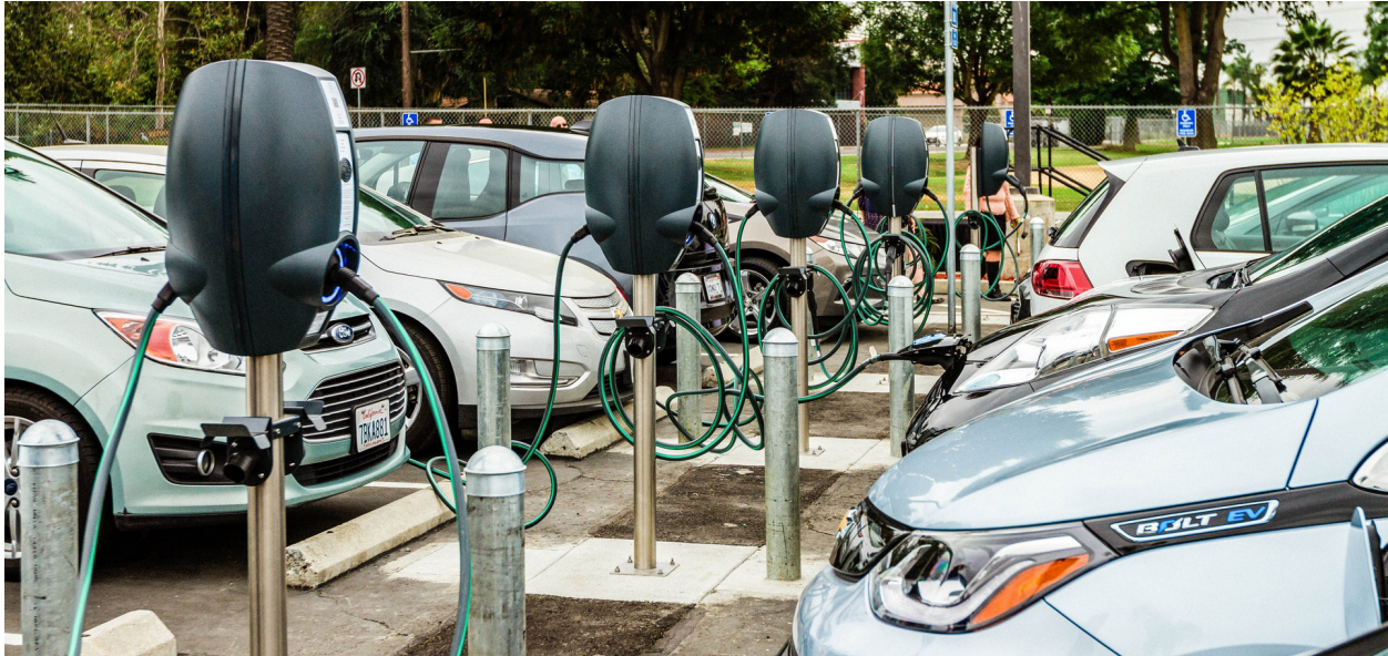
Charging stations in South El Monte. To date, SCE's Charge Ready program, with its customers and partners, has installed more than 1,000 EV charging ports at more than 60 different sites.

Tracking and applying for these grant opportunities can help local government entities proactively plan for the deployment of charging infrastructure.