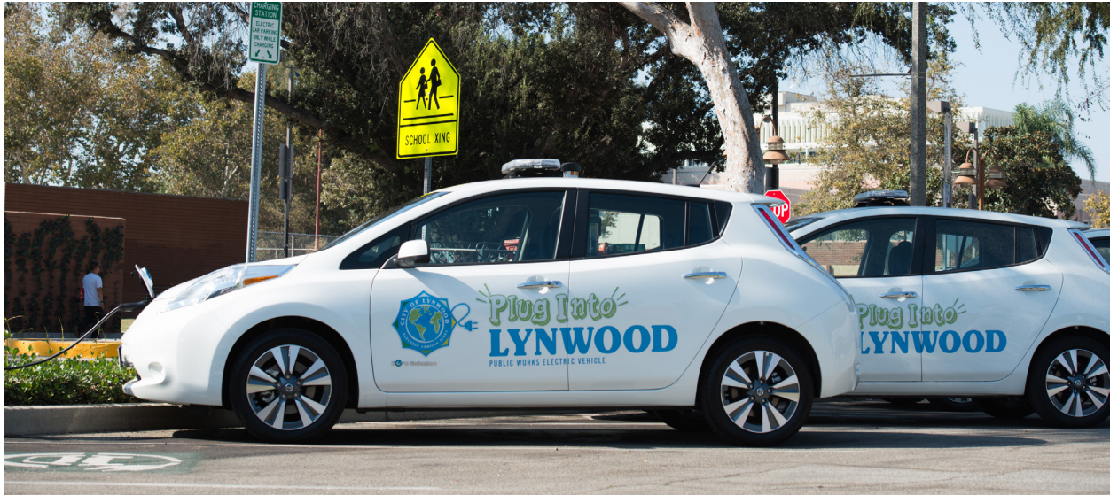
The city of Lynwood was the first to take part in SCE's Charge Ready program, having six EV charge ports installed for the city's new EV fleet.