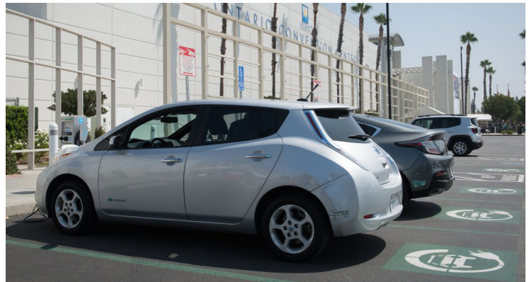
Through the Charge Ready program, the city of Ontario installed more than 45 EV chargers throughout the city, including at the Ontario Convention Center (pictured).

Some cities have designated a single point of contact to help permit applicants seeking to install EV chargers to navigate the process from end to end. This point of contact is knowledgeable on each step of the permitting process and can function as an ombudsman for the applicant. This helps both staff responsible for permit review as well as the applicant since this point of contact has a line of sight to the entire process. This person need not necessarily be a dedicated full-time employee. By expediting the permitting process, cities can remove a significant barrier to adoption for charging infrastructure.