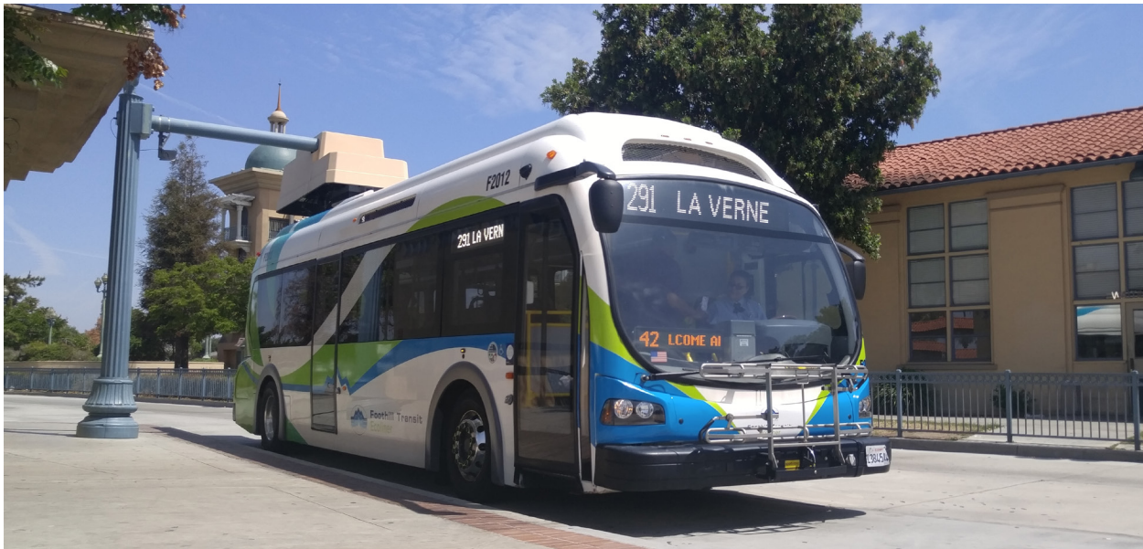
Foothill Transit established the first fast-charge electric bus line in the U.S. in 2014 and plans to complete fleet electrification by 2030.

As fleet purchases are a recurring item in a city or county's budget, EV options could be considered a minor-to-moderate incremental cost. In assessing cost-effectiveness, EVs routinely offer lower lifetime operating costs than their diesel counterparts, based on lower fuel and maintenance expenses.